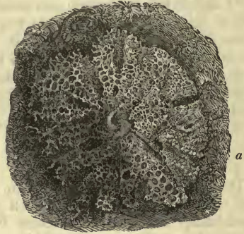
Fig. 1. Exterior surface complete.